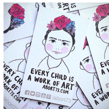
ABORT73 PROMO CARDS: Stash some in your wallet or purse and be ready to hand them out or strategically leave them behind.