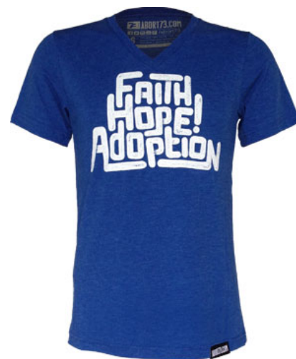
ABORT73 SHIRTS: Be a walking billboard for Abort73.com.