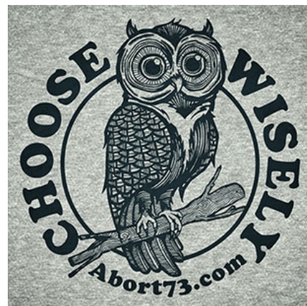
SOCIAL MEDIA GRAPHICS:

Abortion persists because of ignorance, apathy and confusion. Abort73 is working to change that; you can help! Get started below: