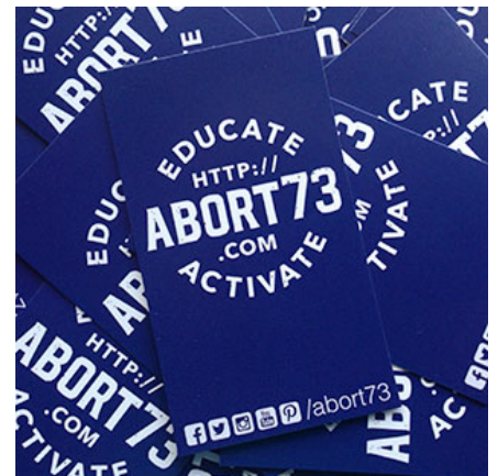
ABORT73 PROMO CARDS: Stash some in your wallet or purse and be ready to hand them out or strategically leave them behind.