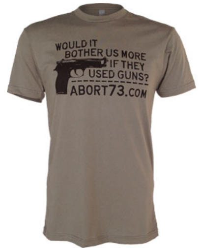
ABORT73 SHIRTS: Be a walking billboard for Abort73.com.

Post them online to introduce your friends, fans or followers to Abort73.com.