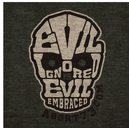
SOCIAL MEDIA GRAPHICS:

Abortion persists because of ignorance, apathy and confusion. Abort73 is working to change that; you can help! Get started below: