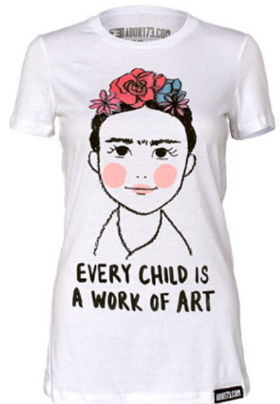
ABORT73 SHIRTS: Be a walking billboard for Abort73.com.

Post them online to introduce your friends, fans or followers to Abort73.com.