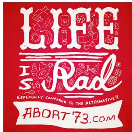
SOCIAL MEDIA GRAPHICS:

Abortion persists because of ignorance, apathy and confusion. Abort73 is working to change that; you can help! Get started below: