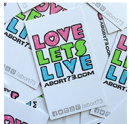
ABORT73 PROMO CARDS: Stash some in your wallet or purse and be ready to hand them out or strategically leave them behind.