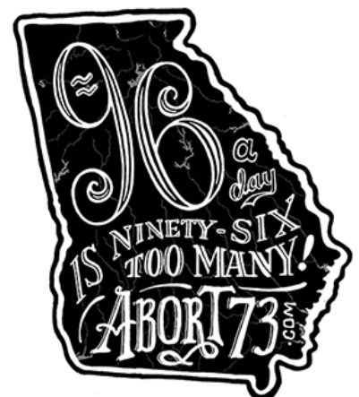
f t i y p /abort73