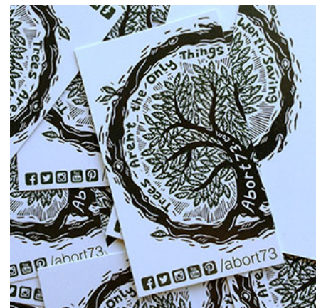
ABORT73 PROMO CARDS: Stash some in your wallet or purse and be ready to hand them out or strategically leave them behind.