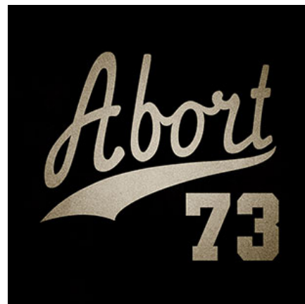
SOCIAL MEDIA GRAPHICS:

Abortion persists because of ignorance, apathy and confusion. Abort73 is working to change that; you can help! Get started below: