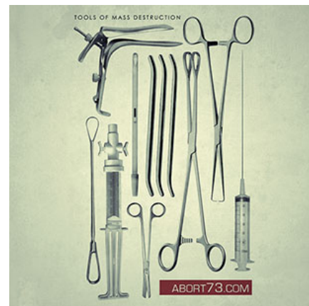
SOCIAL MEDIA GRAPHICS:

Abortion persists because of ignorance, apathy and confusion. Abort73 is working to change that; you can help! Get started below: