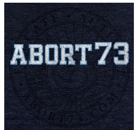
SOCIAL MEDIA GRAPHICS:

Abortion persists because of ignorance, apathy and confusion. Abort73 is working to change that; you can help! Get started below: