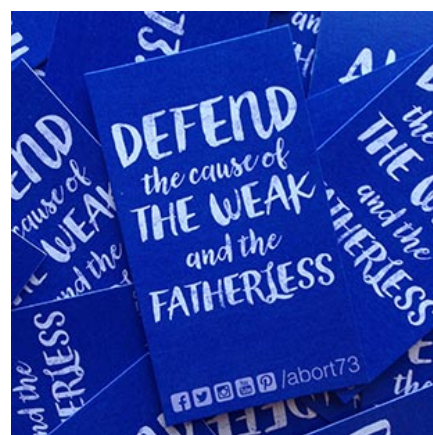
ABORT73 PROMO CARDS: Stash some in your wallet or purse and be ready to hand them out or strategically leave them behind.