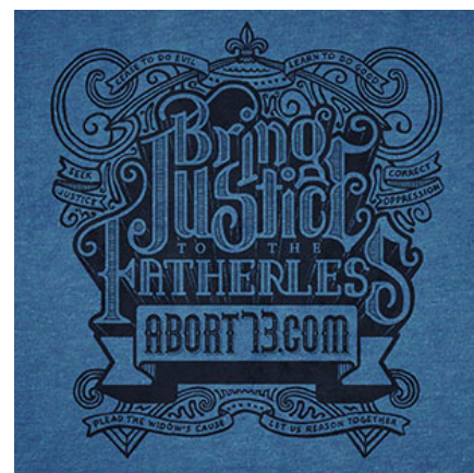
SOCIAL MEDIA GRAPHICS:

Abortion persists because of ignorance, apathy and confusion. Abort73 is working to change that; you can help! Get started below: