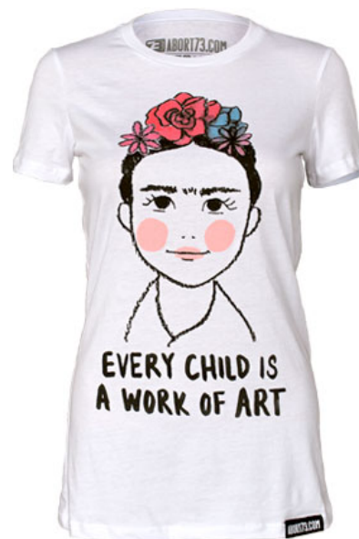
ABORT73 SHIRTS: Be a walking billboard for Abort73.com.

Post them online to introduce your friends, fans or followers to Abort73.com.