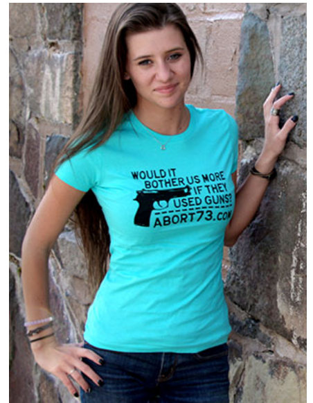
ABORT73 SHIRTS: Be a walking billboard for Abort73.com.

Post them online to introduce your friends, fans or followers to Abort73.com.