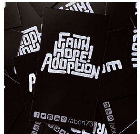
ABORT73 PROMO CARDS: Stash some in your wallet or purse and be ready to hand them out or strategically leave them behind.