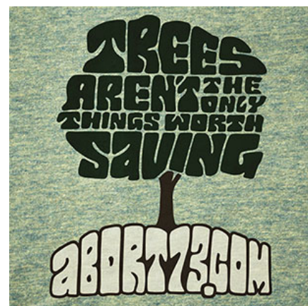
SOCIAL MEDIA GRAPHICS:

Abortion persists because of ignorance, apathy and confusion. Abort73 is working to change that; you can help! Get started below: